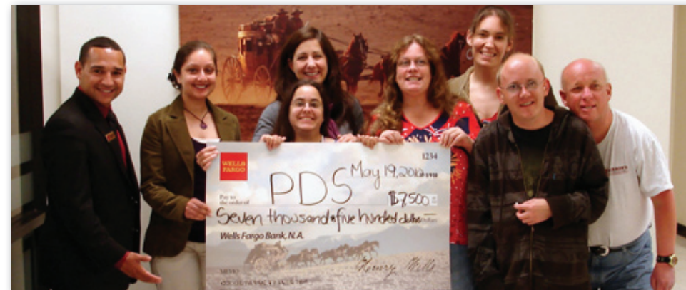
Wells Fargo presenting PDS with a generous donation. May 2010

Thanks to The Special Hope Foundation and our other generous listed in this newsletter, the venue for our presentation will be at a lovely location in Sausalito and will include a complimentary lunch for attendees, providing a nice backdrop for the filming of the seminar, for our web based training video.